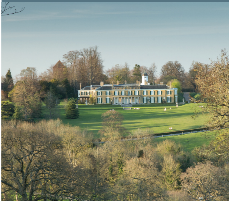
Polesden Lacey, near Dorking

Information: surreysculpturesociety.org.uk or surreyhills.org