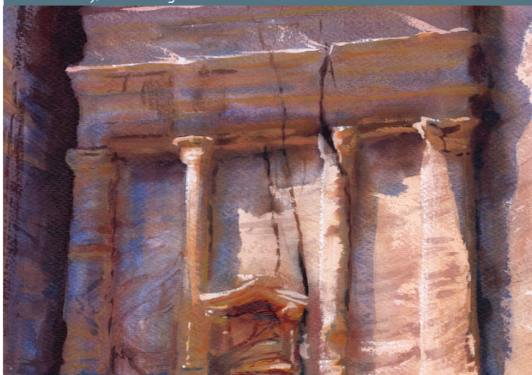
Street of Facades, Alexander Creswell, Watts Gallery