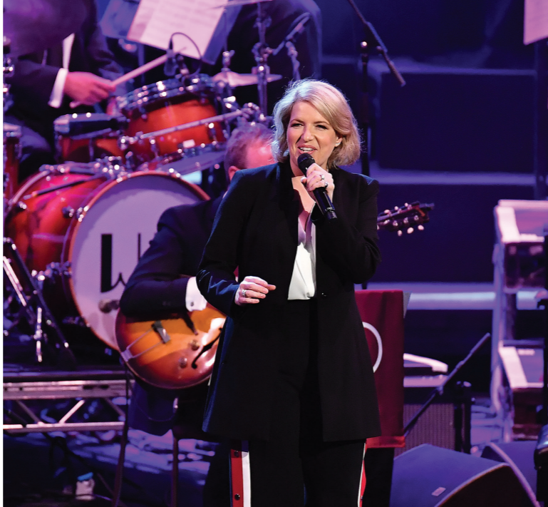
Clare Teal, Investec International Music Festival

Terms and conditions: This package is valid pre or post-show for Wednesday to Sunday evening performances at 7.30pm, excluding all matinees and Saturday performances until 31 May 2019, at the Garrick Theatre London, subject to availability. It includes a Band A ticket and three-course meal from the Formule menu with a glass of house wine at Brasserie Zédel and includes service charge. Guests must be seated in Brasserie Zédel by 6pm pre-theatre or 11pm post-theatre for Wednesday to Sunday evening performances. You must present your ticket in order to claim your Formule Menu meal. No cash alternative available to any elements of the package. Alcohol will only be served to over 18s. Soft drink alternative is available. Reservations must be made at least 48 hours in advance. Subject to availability.