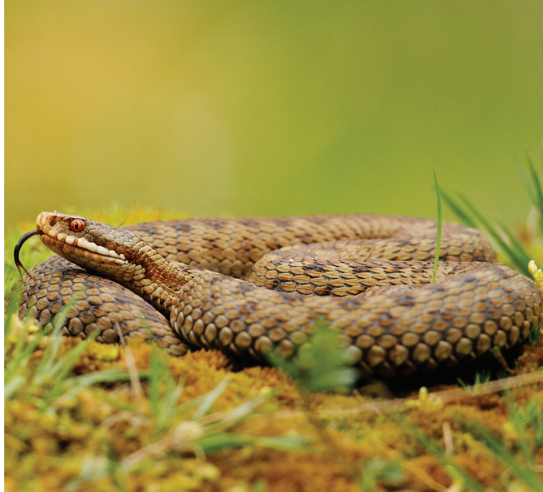
Reptile ecology and survey, Surrey Wildlife Trust

Terms and conditions: The winner is entitled to a complimentary pair of tickets to Stella Live on 10 or 11 May 2019. Tickets include entry to one four and a half hour session. Available sessions: Friday 10 May, noon–4.30pm or 5.30–10pm; Saturday 11 May, 11am–3.30pm or 4.30–9pm, subject to availability. Upon arrival, the ticket winner will receive one glass of Mirabeau La Folie sparkling rosé and access to all standard talks. The prize does not include travel to or from the event. The ticket code will expire at midnight on Wednesday 8 May 2019. Entrants must have a valid email address as tickets will be supplied as e-tickets. It is the entrant's sole responsibility to ensure contact details are up to date. The winner will be required to become a registered user of The Telegraph . Tickets are non-transferable.