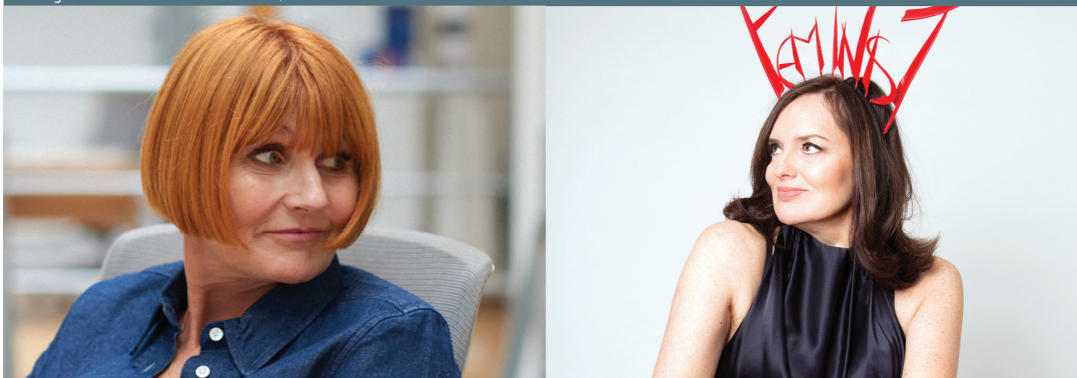
Mary Portas in Conversation, Farnham Maltings