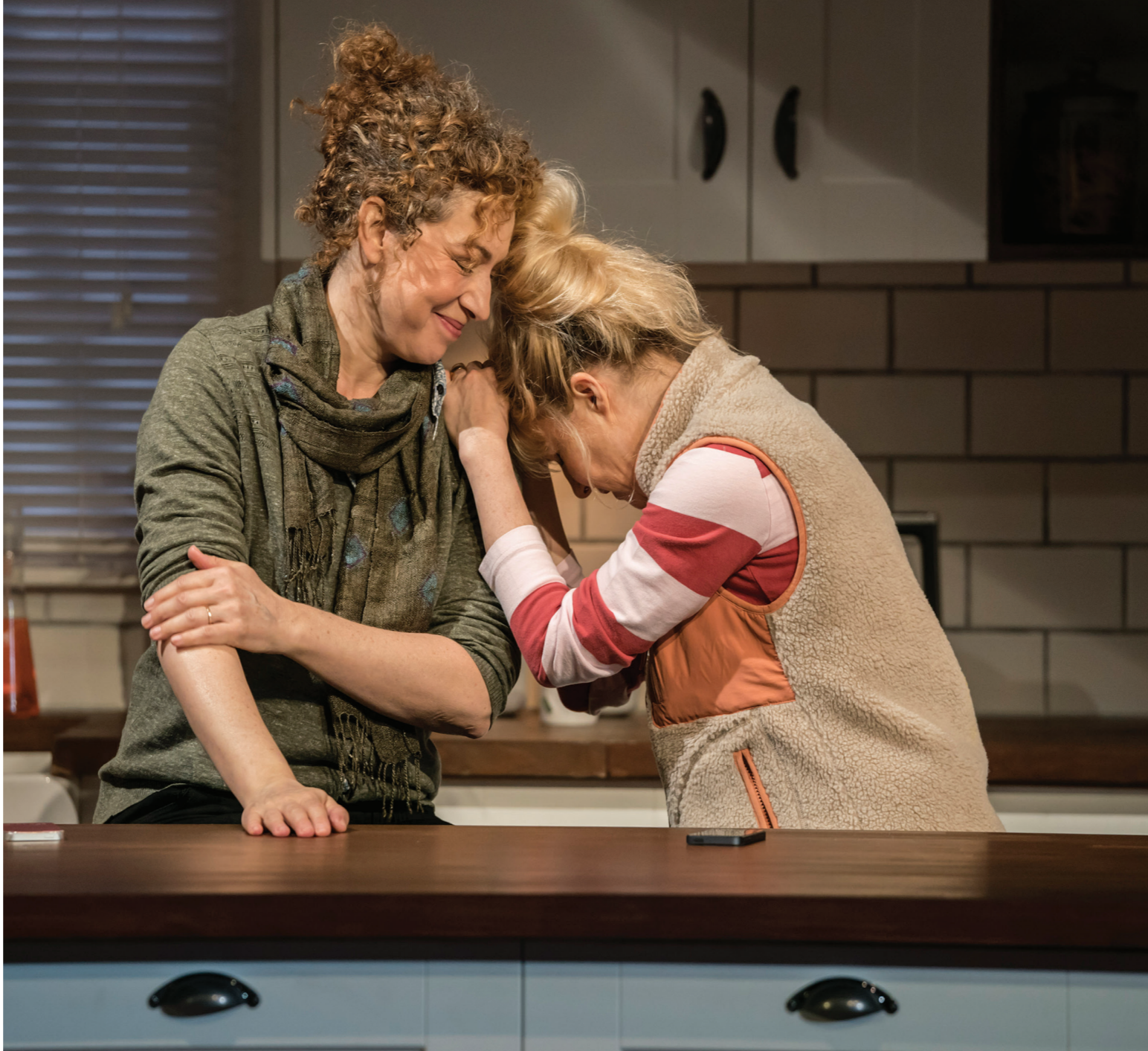
Alex Kingston and Sarah Hadland in Admissions, Richmond Theatre

New stand-up show from this witty and thought-provoking comedian.